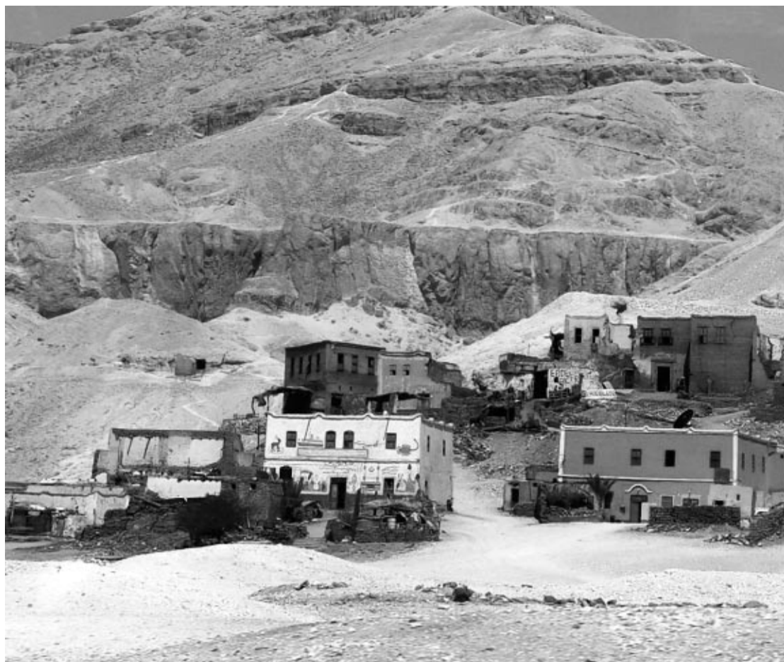
HOT STUFF Egypt's deserts offered many different and unusual sights.

Once at the hotel, our group was met by the hotel staff with a welcome drink of hibiscus. It was a real thirst-quencher for all as the temperature outside was soaring. After dumping our bags in our